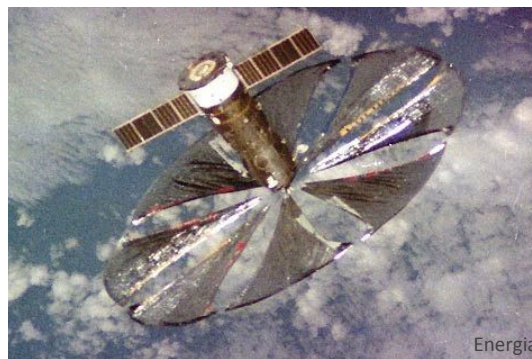
Solar power from space